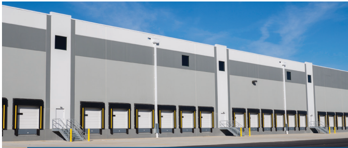
Dermodity Properties: Logisticcenter 33 Forks Township, PA | 476,928 s.f.

Mowery has done over 50 Industrial projects all over the state of Pennsylvania and is currently working on one in Martinsburg, West Virginia