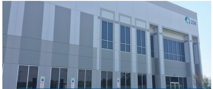
Prologis Development Corporation: Georgia Pacific Distribution Center Shippensburg, PA | 1,495,720 s.f.