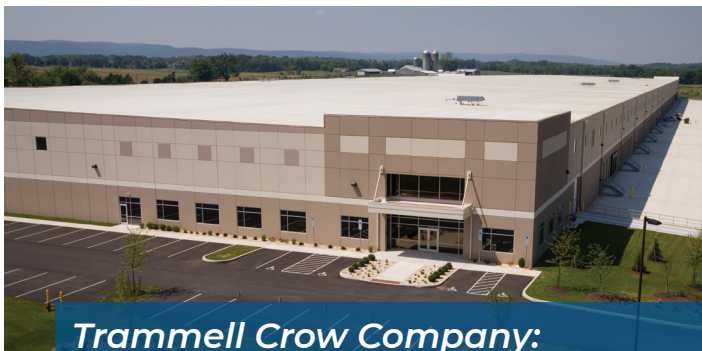
Trammell Crow Company: Mountain Creek Distribution Center Carlisle, PA | 700,000 s.f.