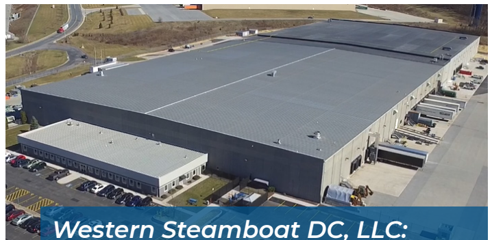
Western Steamboat DC, LLC: L'Oreal Salon Centric Building Expansion York, PA | 160,000 s.f.